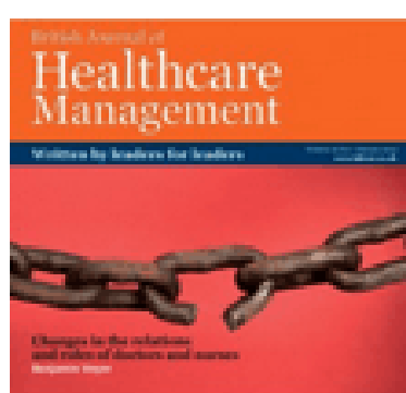
British J. of Healthcare Management