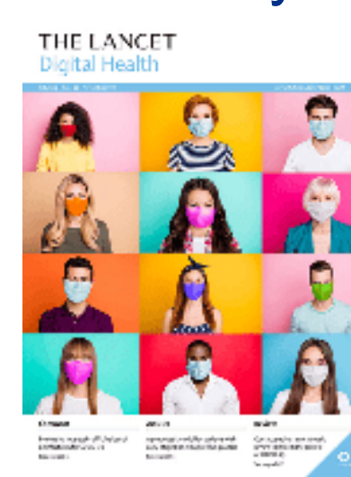
Lancet Digital Health