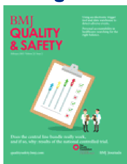
BMJ Quality & Safety